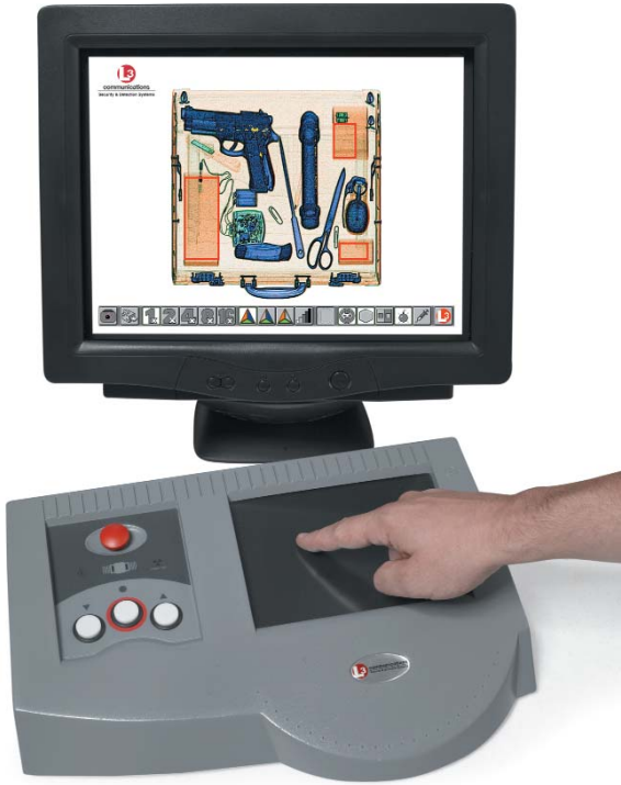
L-3’s patented operator interface combines 3-button conveyor control with a touch-sensitive pad that allows continuous heads-up operation, using icons displayed on the viewing screen.

Numerous features enhance the operator’s ability to readily identify and examine suspect objects and detect the subtle but telling details that indicate a true threat, such as the wires associated with explosive devices.